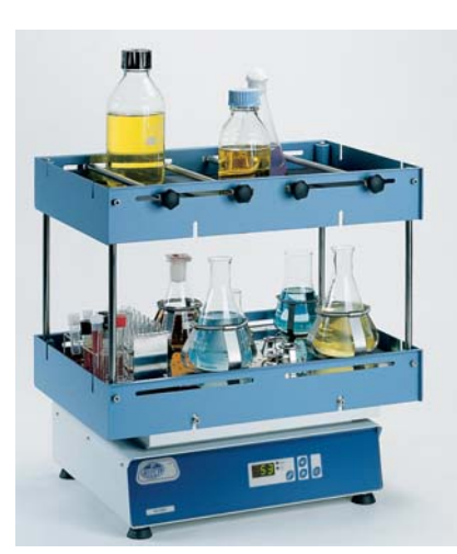
Double platform part no 3001011, with shaker Part No. 3000974